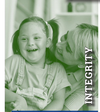
We will use resources efficiently to meet the needs of individuals while being committed to transparency, accountability, and quality.

We will empower and respect individuals to make decisions that are important to them and for them.